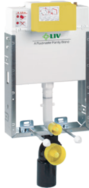
LIV-MOUNT WC 9012 (Art. No. 195850)